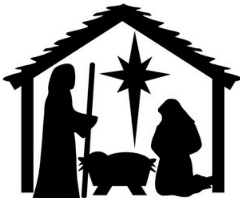
FAMILY NATIVITY WITH CAROLS